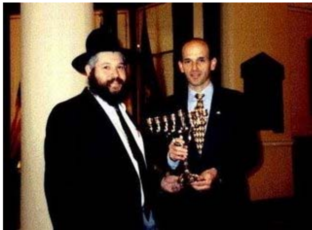
Governor of Maine, John Baldacci

...The Jewish Governor doing his duty before Lubavitch representatives.